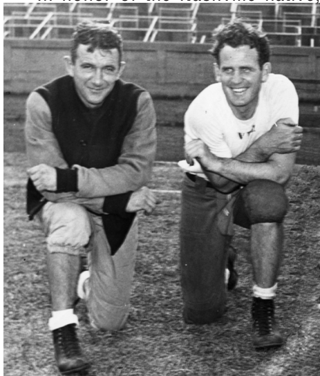
Vandy Coach Henry R. “Red” Sanders (left) and Assistant Coach Paul “Bear” Bryant

U.C.L.A. gives its annual “Henry R. ‘Red’ Sanders” Award to the Most Valuable Player on the team at its annual U.C.L.A. Football Awards Banquet.