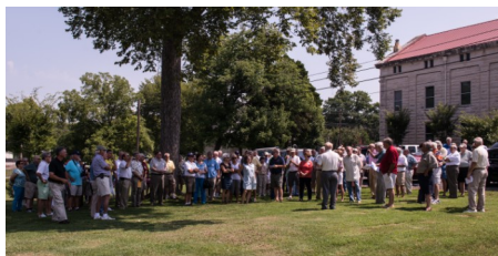
Gathering for the Flag Pole Ceremony to honor the lost Alumni from the Classes of 1964 and 1965.