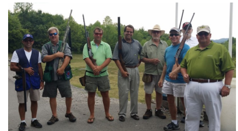
Some of the alums that took on the reunion's newest event, the Sporting Clays Shooting Competition.