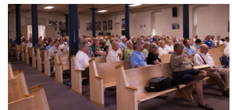
Alumni gathered in Old Main for the General Membership meeting on Saturday Morning.