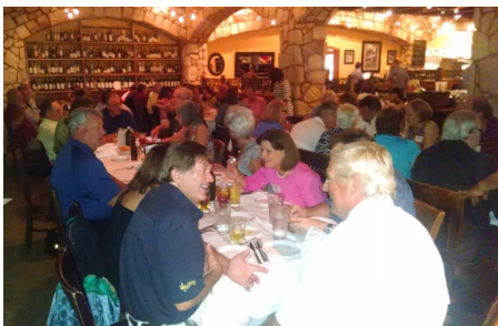
Seventy five alums and guests from the Decade of the 70's got together for dinner Friday night at Romano's Macaroni Grill in Cool Springs.