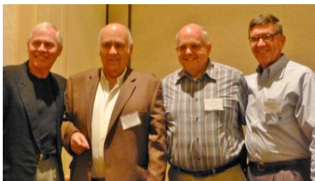
No Barbershop Quartet but a great group of Alumni sharing some time together Saturday night.