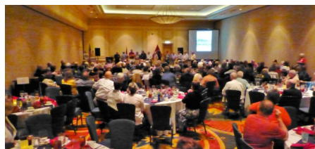
Saturday Night Banquet.