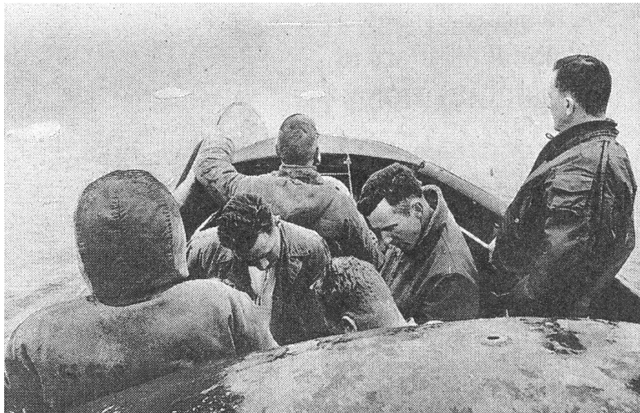
CONNING TOWER VIEW...Capt. Anderson, right, on the conning tower of the submarine Nautilus in August, 1958. Several times during the Polar cruise, Anderson and members of the Nautilus crew searched for a spot of sufficient depth to submerge beneath the ice.