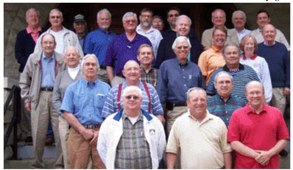
CMAAA Board Members