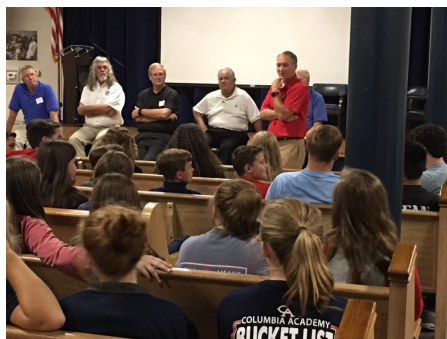
The students were engaging and asked great questions.

Some of the alumni took time during the lunch period to go eat in the Mess Hall and visit with the students there. That was a great time for those who participated...the students were very engaging and wanted to hear even more stories about CMA.