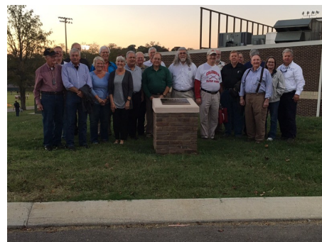
Some of the alumni at the Moore Hall Memorial dedication and the ball-game. Naturally, there were several others that were late for the formation. Some things never change.